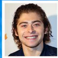
Ryan Ochoa iCarly

Vendors | Cosplay Contest Giveaways | MTG Tournament Video Game Tournaments Arcade Machines | Food Trucks