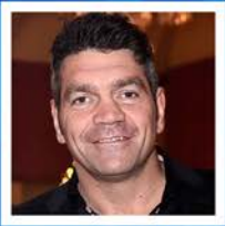
Spencer Wilding Rogue One: A Star Wars Story